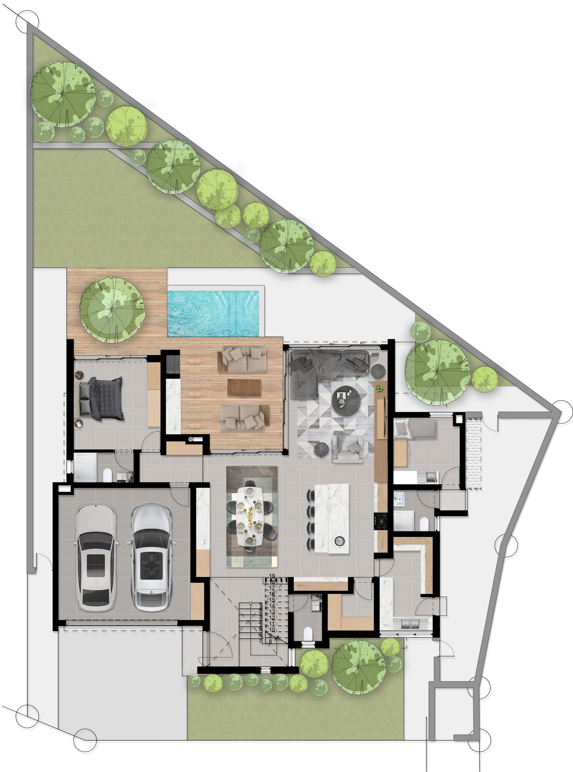
GROUND FLOOR Scale 1:100