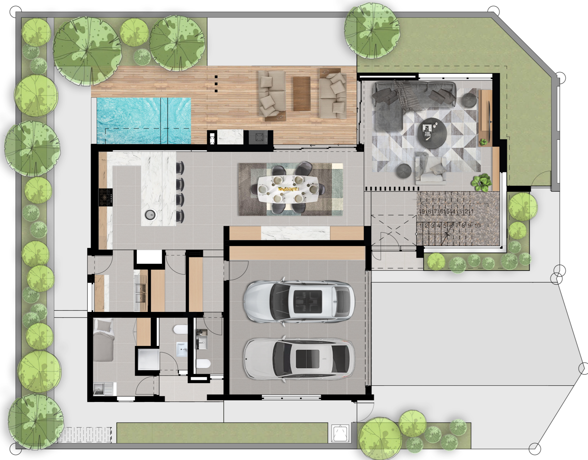
GROUND FLOOR Scale:1:100